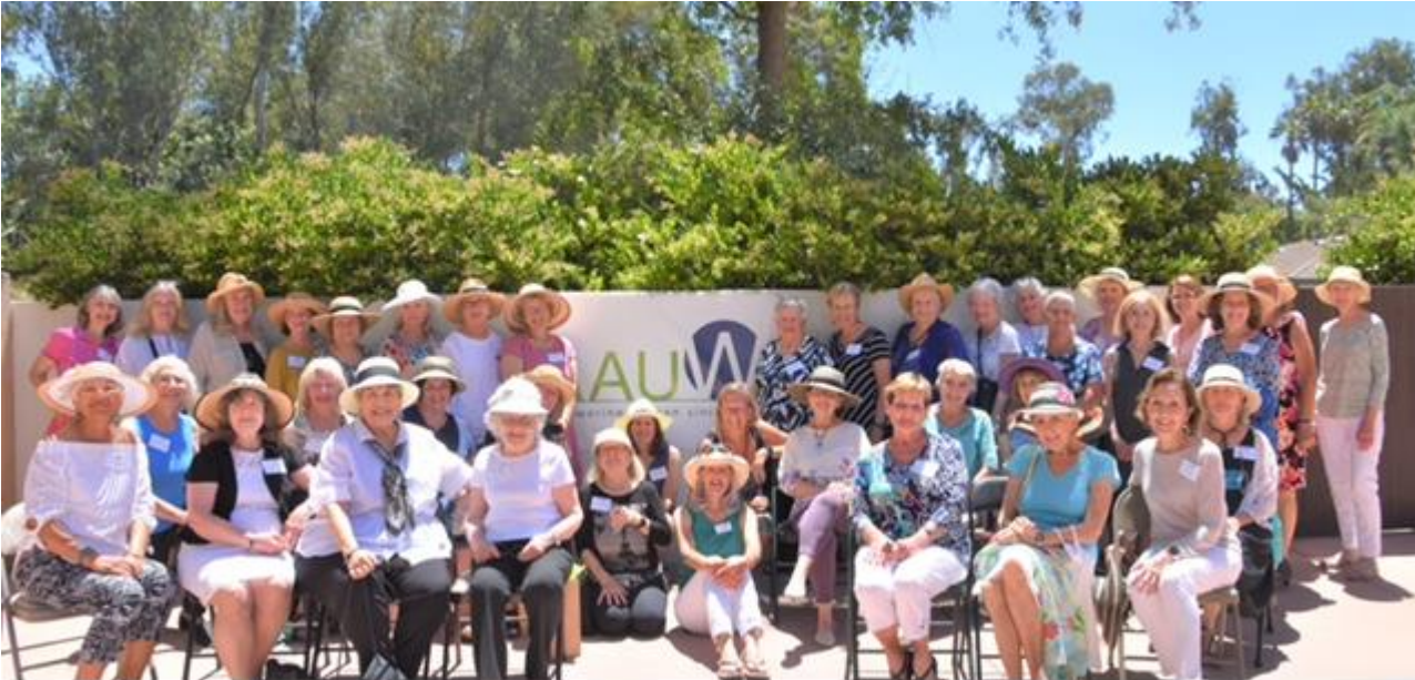
Most of the June 12 attendees. (Some attendees left early.)