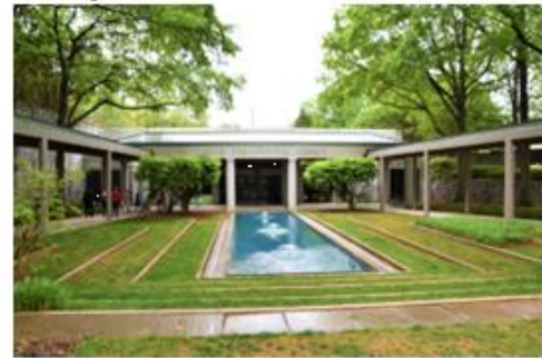
President Jimmy Carter Presidential Center

Road Scholar Trip 3 nights Atlanta, Georgia 2 nights Montgomery, Alabama 2 nights Birmingham, Alabama Walk across the Edmund Pettus Bridge, Visit the Carter Center, Visit the powerful Legacy Museum Go to the Rosa Parks Museum, Civil Rights Museum and much more