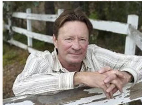
Meet T. Jefferson Parker, Edgar Award Winner and NY Times Best-Selling Author of 28 novels