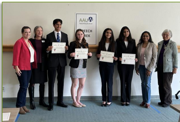
Participants and Judges