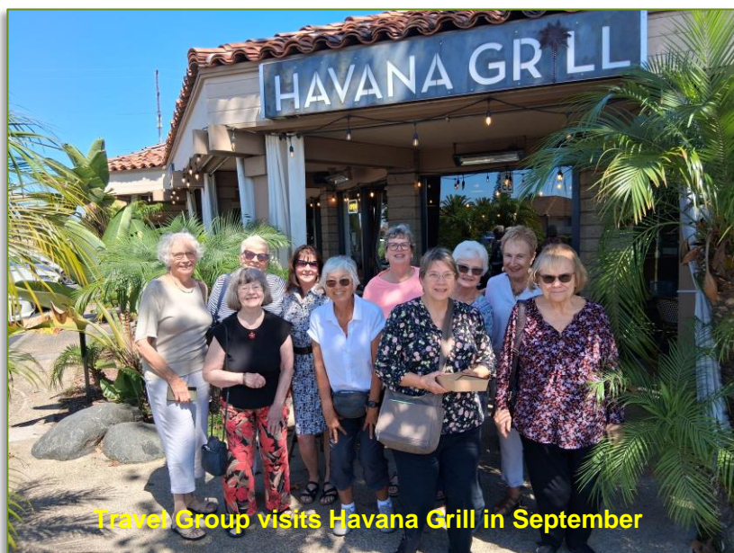
Travel Group visits Havana Grill in September

Please RSVP to Pam Ames at pamames123@gmail.com .